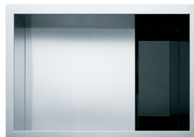
CLV110-24 Crystal Black Glass Single Bowl