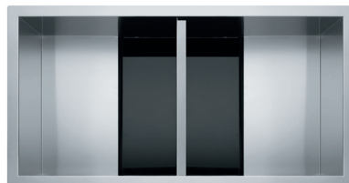
CLV120-33 Crystal Black Glass Double Bowl

Crystal sinks are available in a range of sizes.